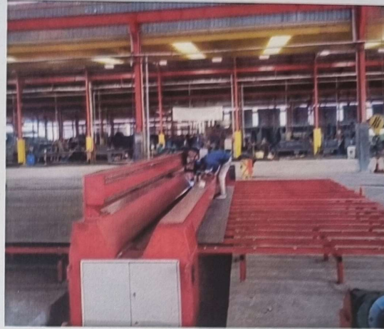
Product picture are for reference only 图片仅供参考